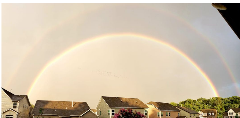
Double rainbow spotted over Kinderton Village after the storm on 7/12/21.

National Friendship Day occurs every year on the first Sunday of August — August 1, 2021 — and celebrates the importance of loving platonic relationships. Friendships are the purest type of human relationships. For more than a century, we've celebrated the strength of friendship, and thanks to social media, we're able to continue celebrating with our friends no matter where they are in the world. Friends are the family that we choose.