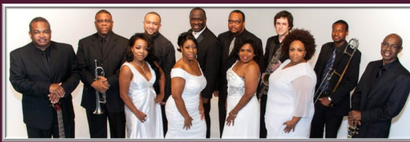
Envision Saturday, August 7, 2021—7 PM (Rain Date Sunday, August 8, 2021— 7 PM)

FREE CONCERTS LOCATED AT: Town Center Kinderton Boulevard (Off HWY 158) Bermuda Run, NC