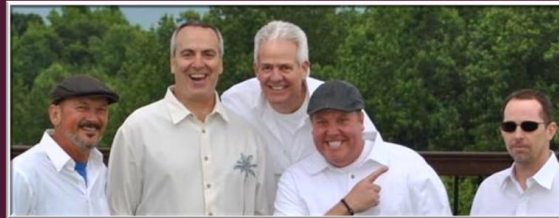
Special Occasion Band Saturday, September 11, 2021—7 PM (Rain Date Sunday, September 12, 2021— 7 PM)

BRING YOUR LAWN CHAIR, PICNIC/COOLER FOR MORE INFORMATION CALL DAVIE COUNTY ARTS COUNCIL: 336-751-3112