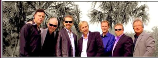
North Tower Saturday, August 14, 2021—7 PM (Rain Date Sunday, August 15, 2021— 7 PM)